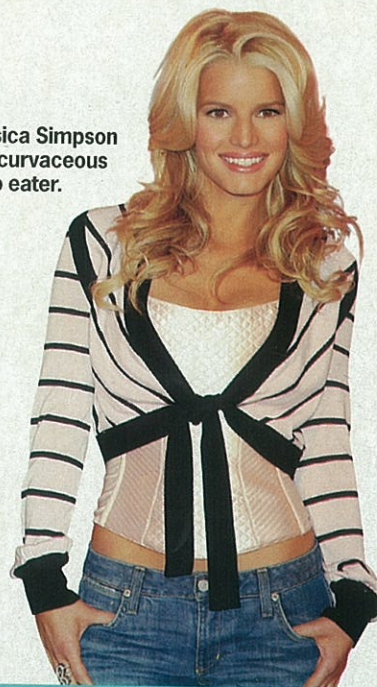
Jessica Simpson is a curvaceous carb eater.