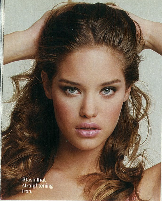
Stash that straightening iron.