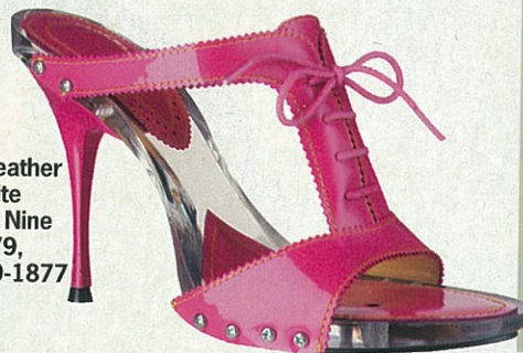
Patent-leather and Lucite sandals, Nine West, $79, 800-999-1877

Clear shoes are ultrahot this season. Tons of designers did high-end versions, but it's easy to find affordable ones too. To avoid looking tarty, pair them with a knee-skimming skirt or cropped pants—nothing too short or tight.